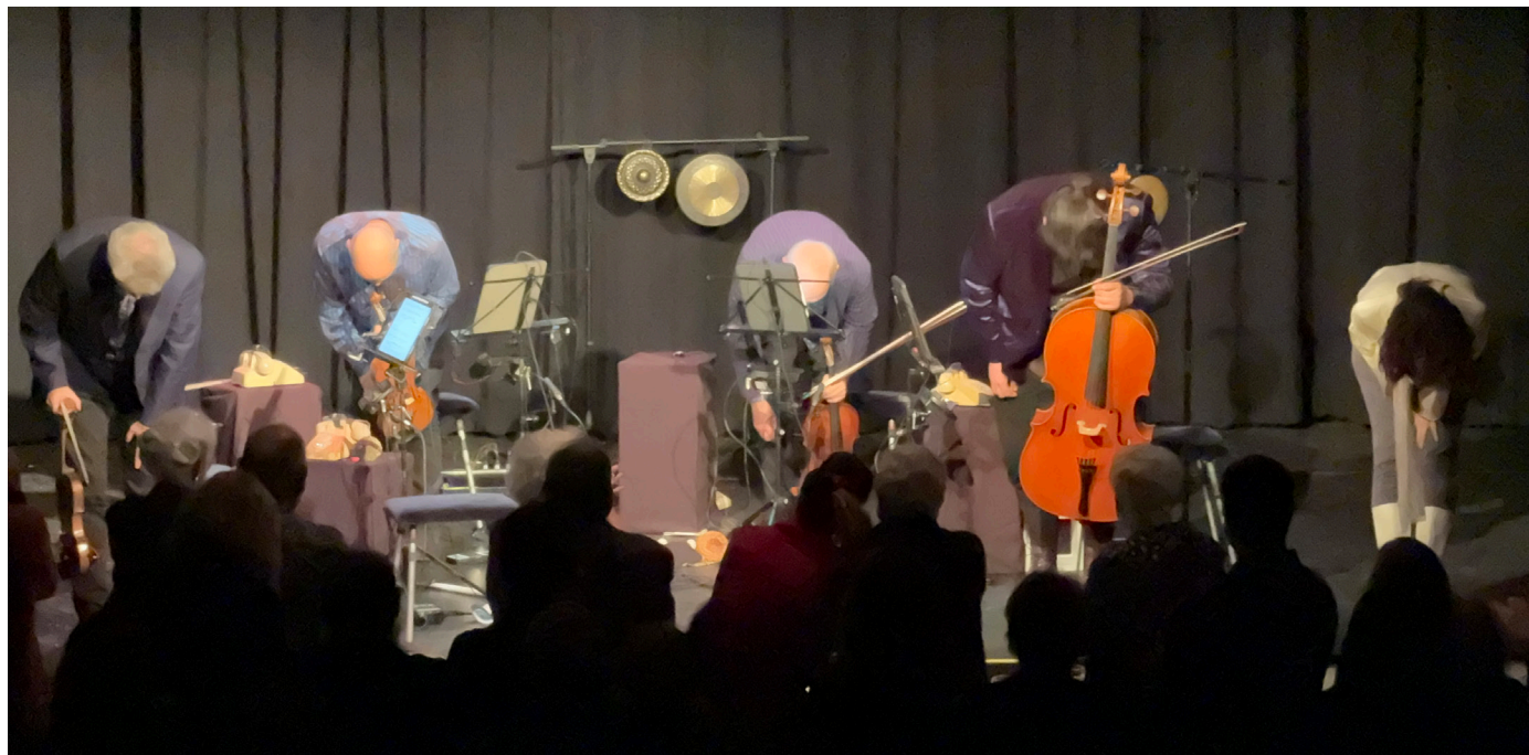
Image: Kronos Quartet Five Decades Concert – Standing ovation with composer Aleksandra Vrebalov / Gold Came From Space * preview at Gualala Arts September 24, 2023