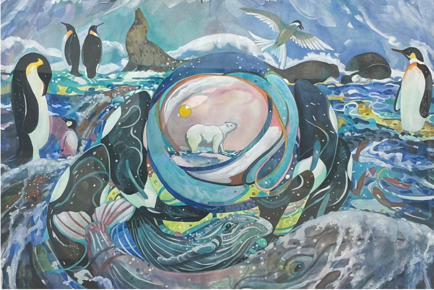
"The Top and the Bottom of It" watercolor by S.E. Routledge