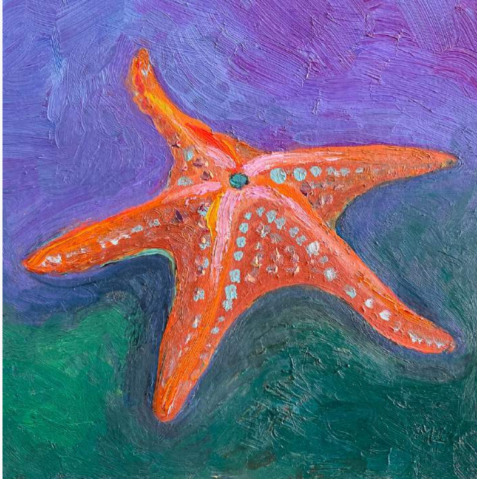
"Sea Star: Pisaster at Night (Nectarine, Fiddles)" by Brandy Gale

"These life forms are well-adapted to live here; it is home. They are the evolved survivors of what we may see as a harsh, challenging habitat and reveal an exquisite balance of life and death as the tide ebbs and flows." Brandy Gale