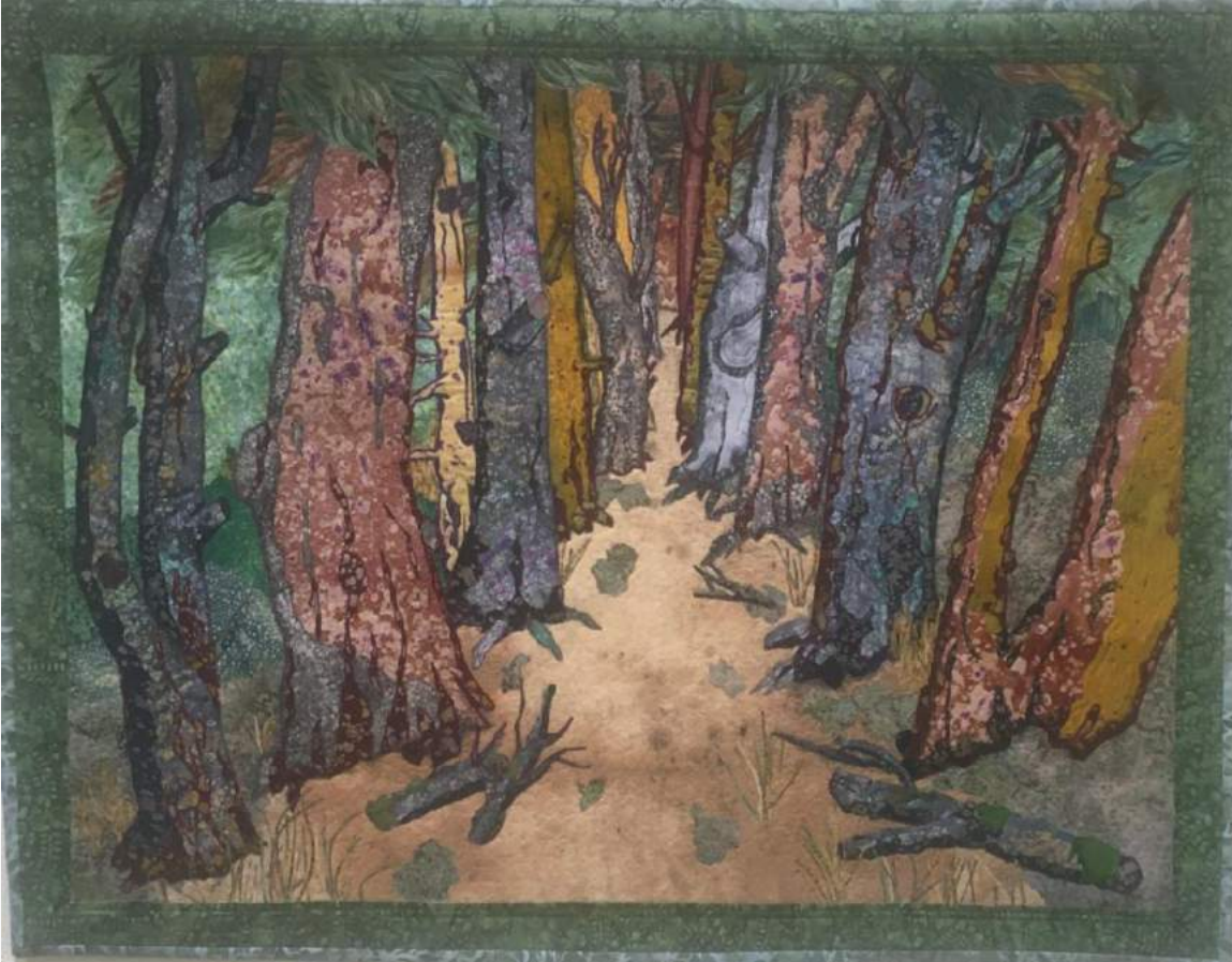
Salon Collage Award Winner. "Hedgerow II" by Margreth Barrett

The art created for the Salon included all types, sizes, shapes and colors. Come and see all of the art, and the judges decisions. Final day, Sunday, July 9.