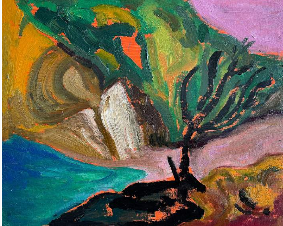
"Point Lobos No. 27"