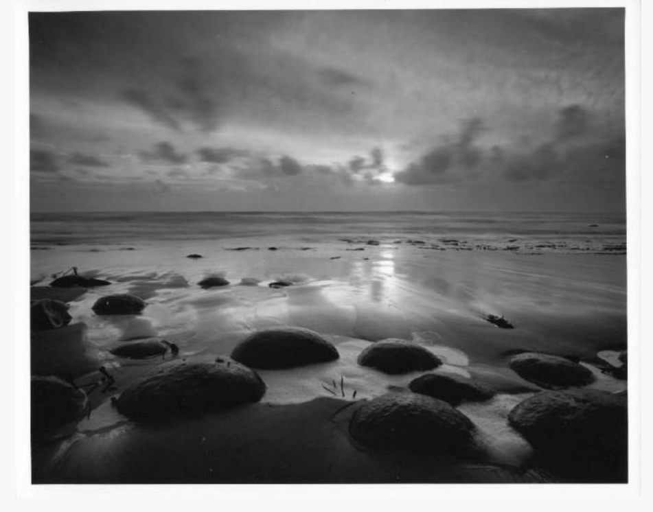
Opening Reception at the Dolphin Gallery Friday, June 2 from 2 pm to 4 pm.