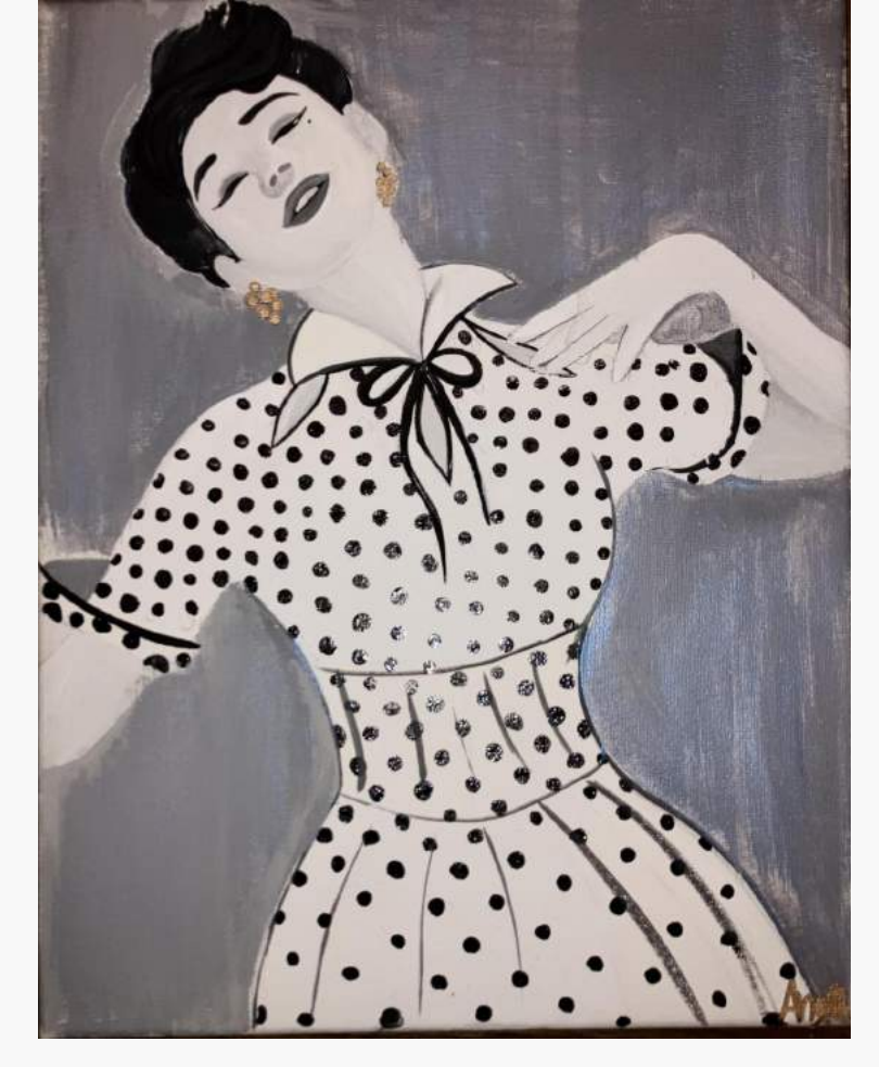
"Women of the World" continues at the Dolphin Gallery in Gualala though May 28, 2023.