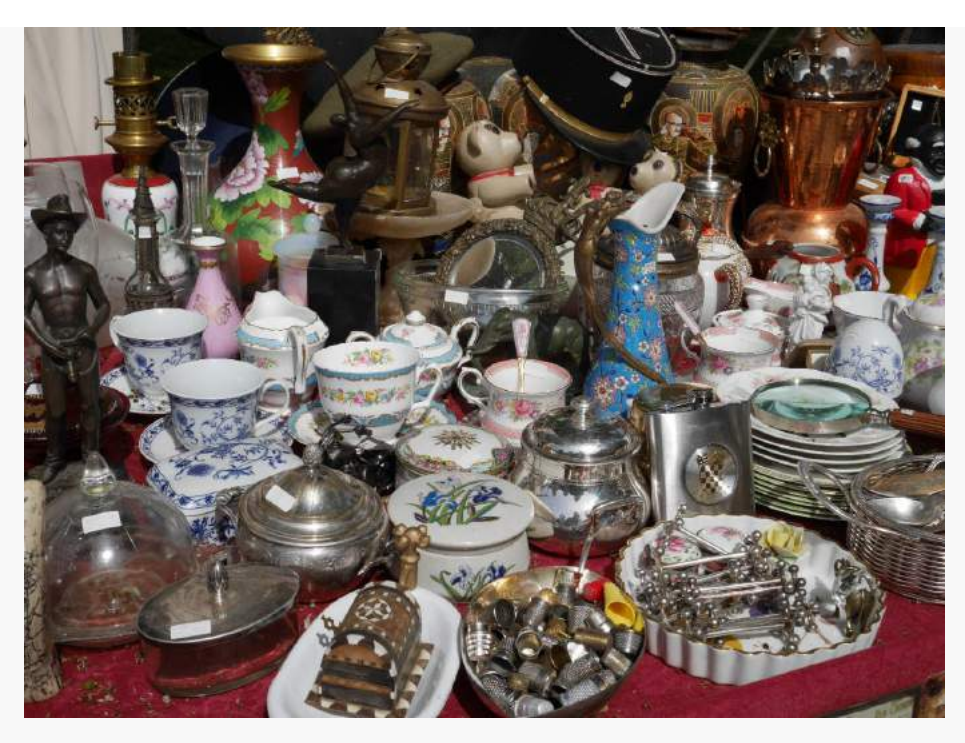
Suggested Image from Photo by Mats Hagwall on Unsplash.

Reserve a spot at the "Hidden Treasures: Antiques Appraisals & Community Swap Meet" on Memorial Day Weekend. This is an added feature at this year's Fine arts Fair Saturday, May 27 from 10 am to 4 pm. Appraise your family treasures, or join in the Community Swap Meet.