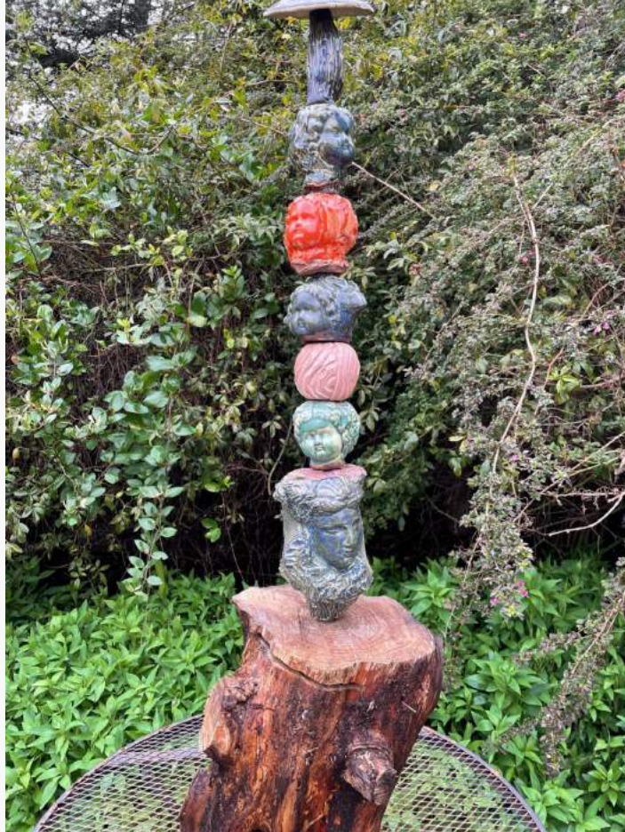
Sculpture by Perry Hoffman.

Explore the new art found in the Sculpture Garden on the grounds of Gualala Arts.