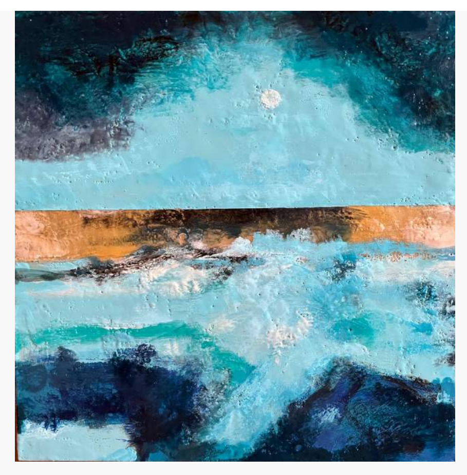
"Once In A Blue Moon" by Larain Matheson

"Encaustic Art: Exploring the Seen and the Unseen", Continuing at the Dolphin Gallery.