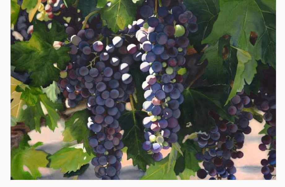
The 36th Annual Architectural Tour, Wine Tasting & Auction, May 12 & 13 Friday 5 pm to 7 pm Korbel Champagne Preview Saturday 10 am to 3 pm Architectural Tour Purchase Tour Tickets Here Saturday 3-5 pm Wine Tasting & Auction Tickets Available Here!