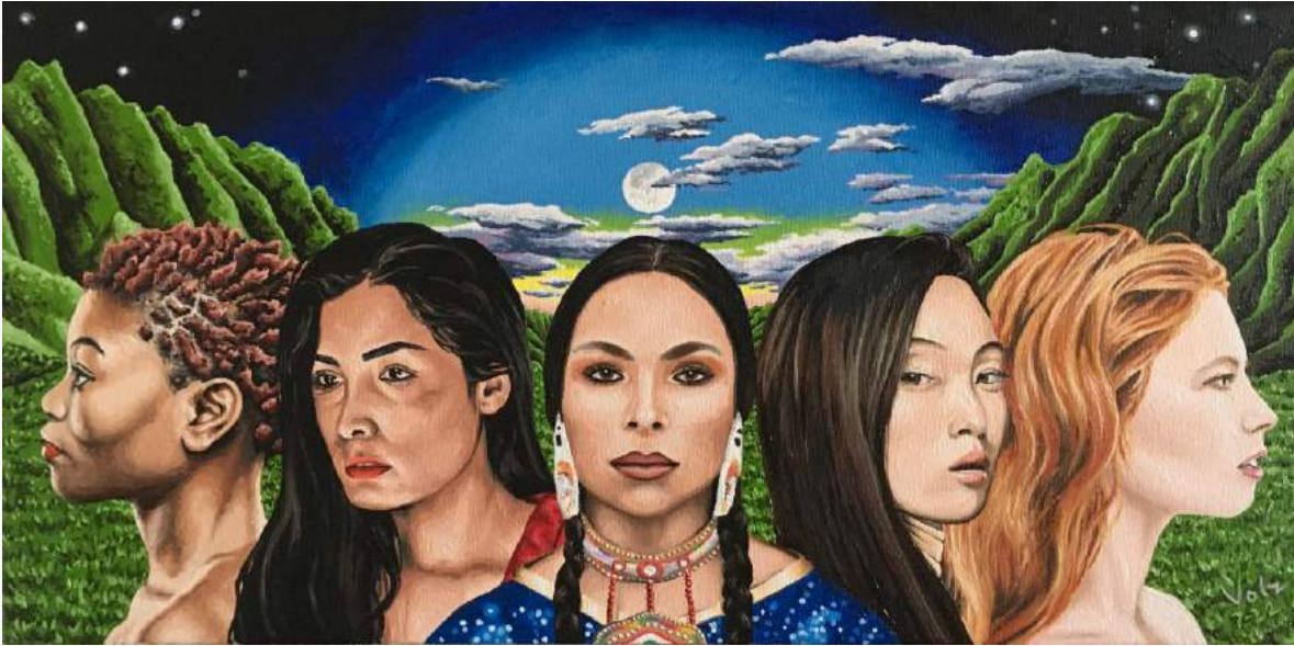
"One Race of Women"

Opens Friday, April 14, 4 pm - 6 pm. The Art of Doug Volz