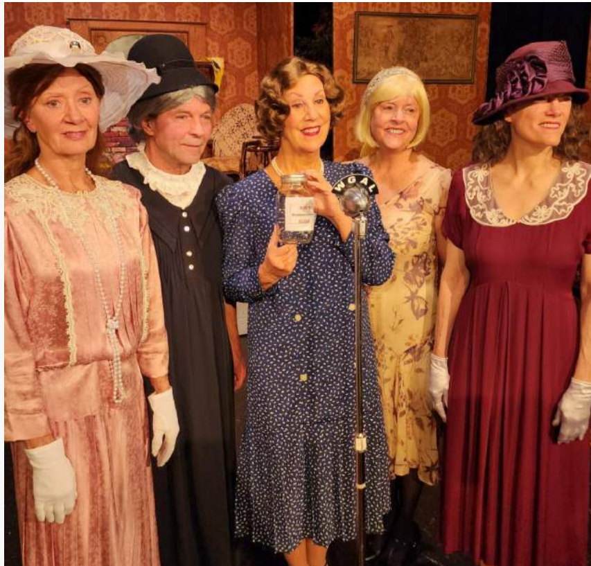
Cast members from "Radio Gals"

"Radio Gals", A Gualala Arts Theater Production Final Performances this Weekend • February 24, 25, 26. Make plans now to attend this delightful new theater production. Tickets here.