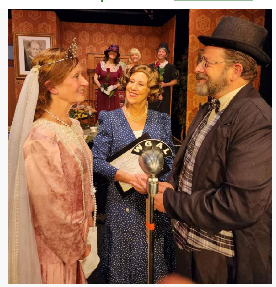
Cast members from "Radio Gals"

"Radio Gals", A Gualala Arts Theater Production Opens This Weekend • February 17, 18, 19. Make plans now to attend this delightful new theater production. <u>Tickets here.</u>