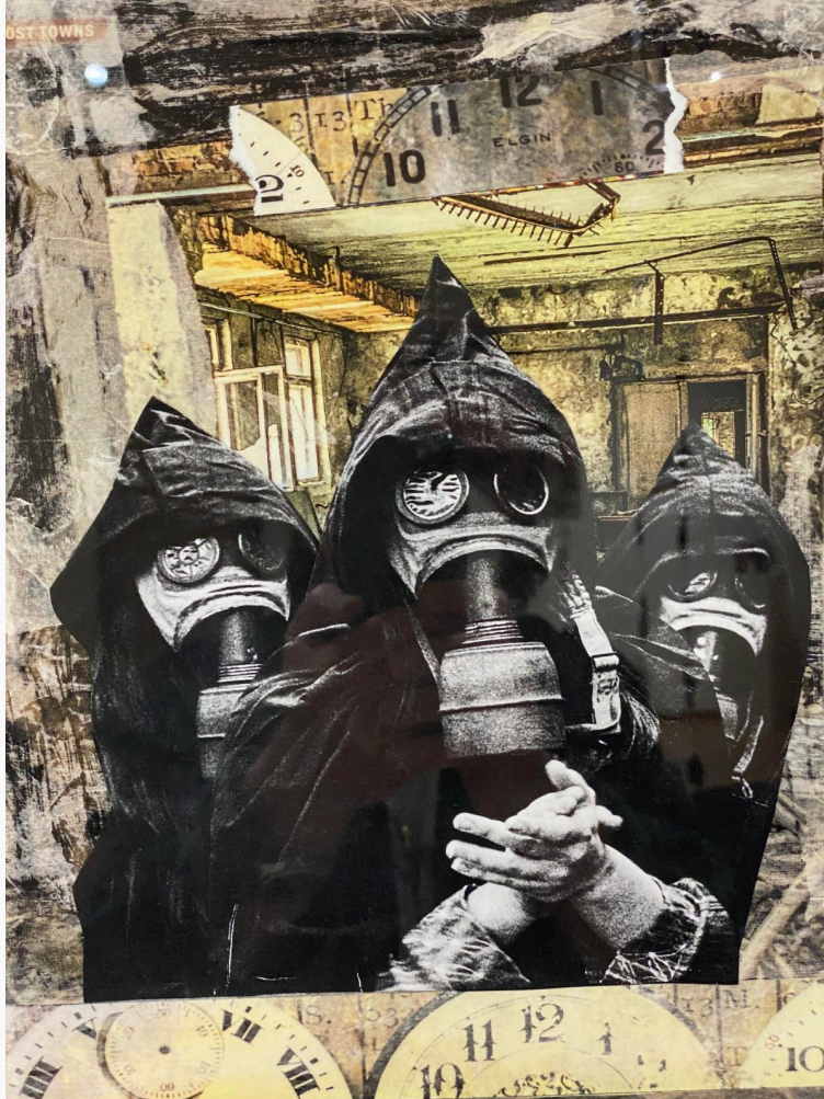
"In Times OF Covid" by Sharon Nickodem

The exhibit continues with the gallery open daily from 11 am to 4 pm.