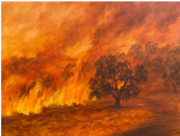
"PG&E Special" by Eiler Sommerhaug

The "Uncomfortable" exhibit will be Open This Friday in the Burnett Gallery.