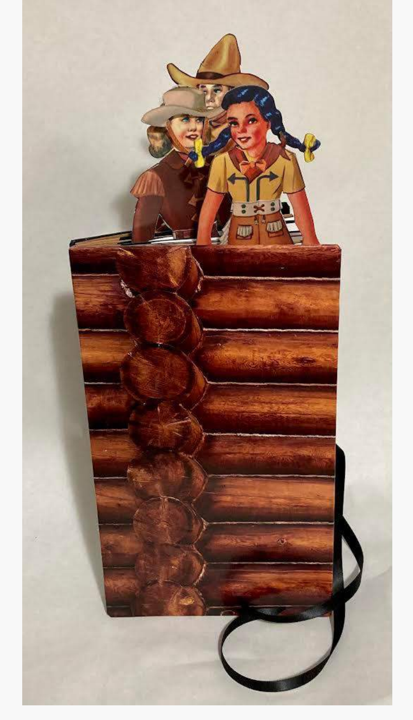
by Polly Hutcheson

The public reception has been scheduled in the Elaine Jacob Foyer on Friday, January 20, from 4 pm to 6 pm. The exhibit will open to the public when feasible.