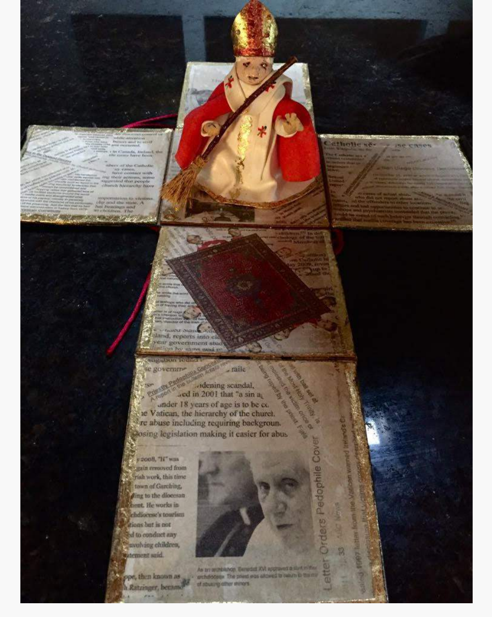
"Pope In A Box" by Jane Head

The public reception has been rescheduled for Friday, January 20, from 4 pm to 6 pm. The exhibit will open to the public when feasible.