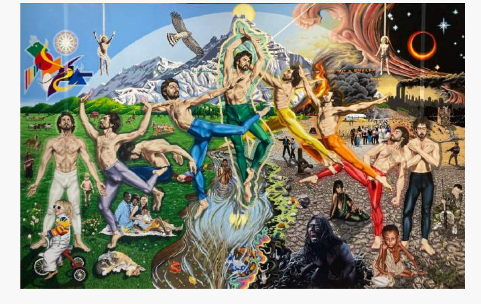
"Crossing The Great Water" by Doug Volz.

The exhibit of works by this Visionary Realist oil painter will be rescheduled later this year.