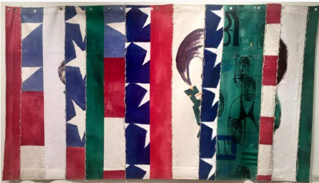
"Frontera Flag #3" by Consuelo Jiménez Underwood

"On The Move: Migration, Emigration, Immigration" Continues at Gualala Arts' Burnett Gallery. 19 Artists bring their powerful and personal works.