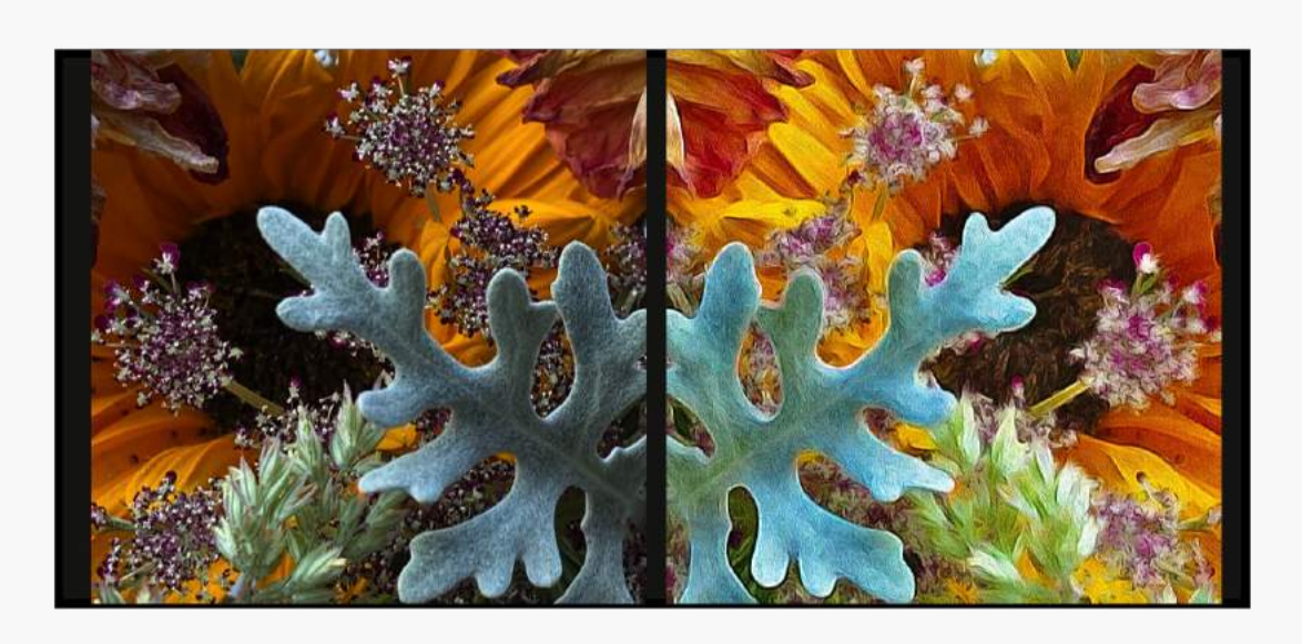
"Bloom" • Image by Joan Halapua Wood