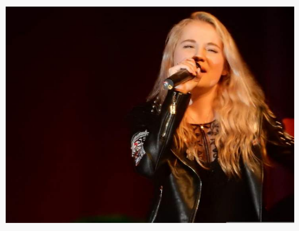
Three Age Groups: Jr. Idol: 7-12; Teen Idol: 13-19; Adult: 20 and up.