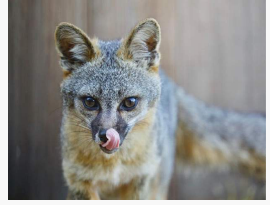
"Catch Me If You Can"