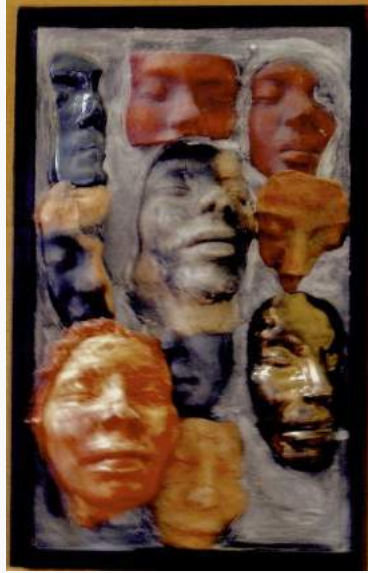
In The "Hood" by Judith Greenleaf

The FINAL WEEKEND for this exhibit at the NEW Dolphin Gallery at the Sea Cliff Center. Judith Greenleaf's "From The Beginning". Meet & Greet Judith on Sunday, Sept. 4 from 2 - 4 pm.