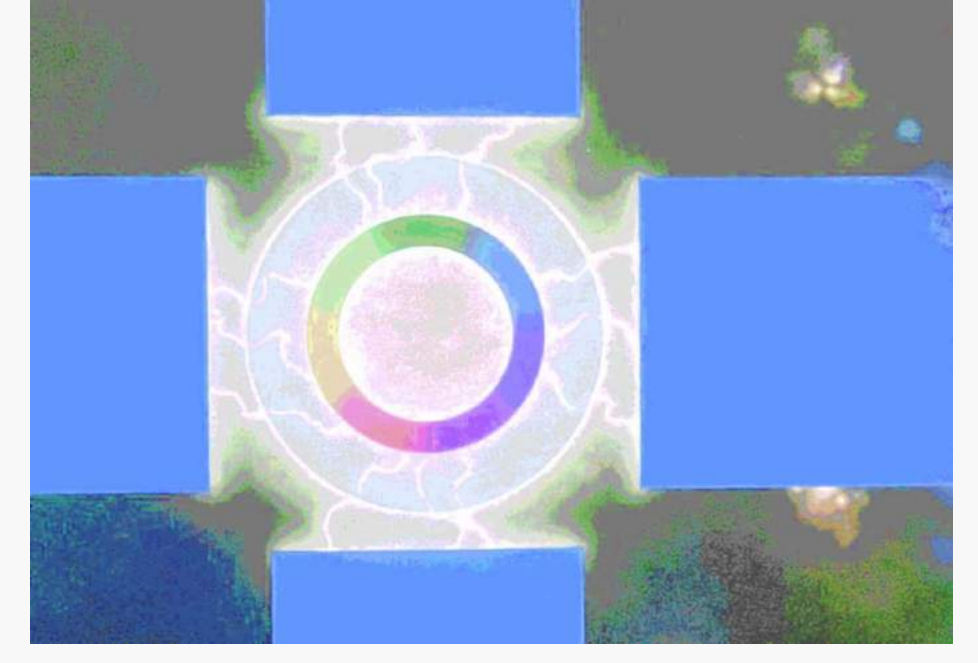
"Celestial Blue Cross" by Brian Denova.

Brian Denova's art continues at Gualala Arts through August 7, 2022. Open daily, 11 am to 4 pm. Exhibit closes Sunday, August 7.