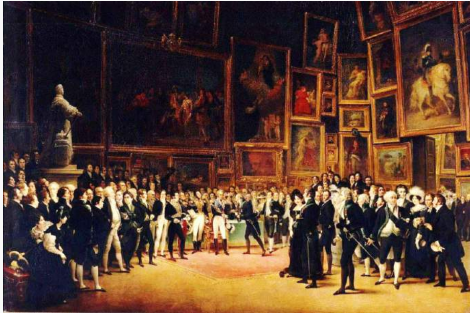
François Joseph Heim's "Paris Salon"

Gualala Salon and Salon des Refusés Opening Friday, June 10 at Gualala Arts.