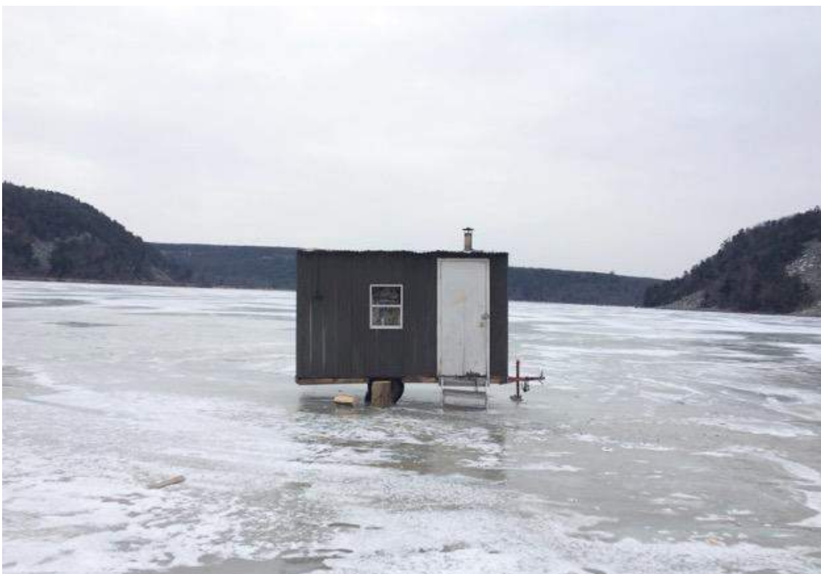
Ice fishing hut at Devil's Lake State Park, Baraboo, Wisconsin, January 14, 2018

Final weekend for "The Beautiful: Poets Reimagine The Nation" Exhibit ends Sunday, May 8.