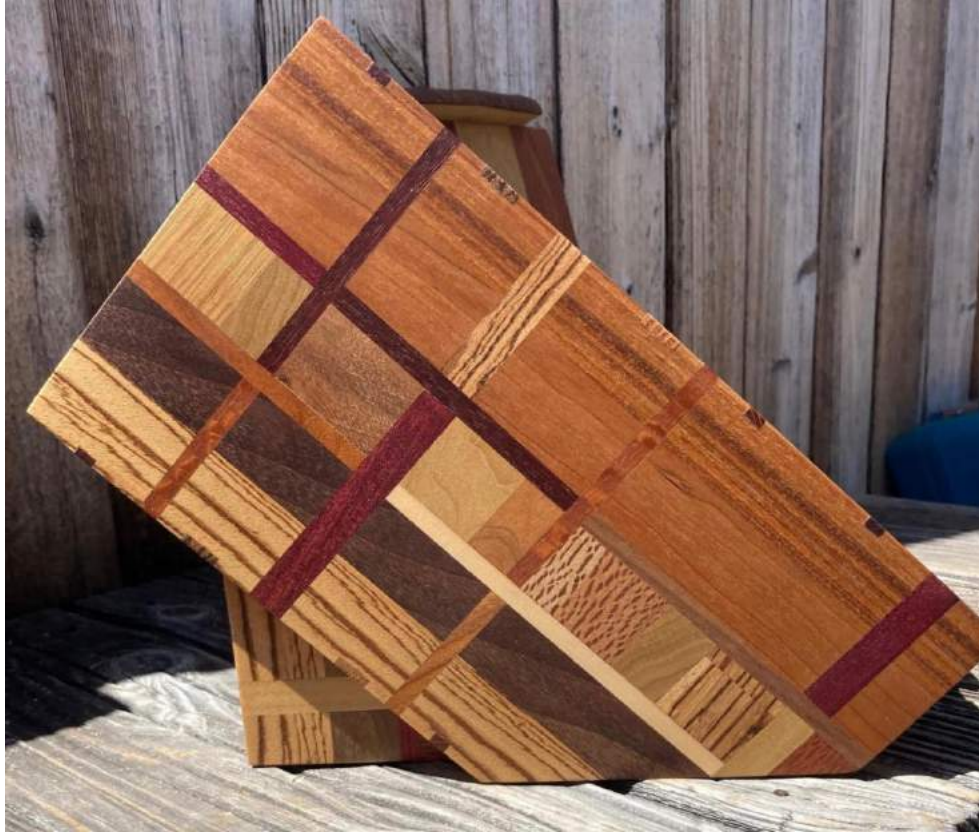
Knife Block by James Docker"

Opens Saturday, May 14 at the Dolphin Gallery. Reception Scheduled from 5 pm to 7 pm.