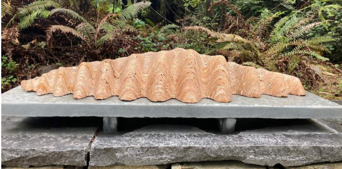
"Dune Top " by Kevin Carman

More than 20 sculptures are included in the new exhibit on the grounds of Gualala Arts. Exhibit opens Friday, April 8.