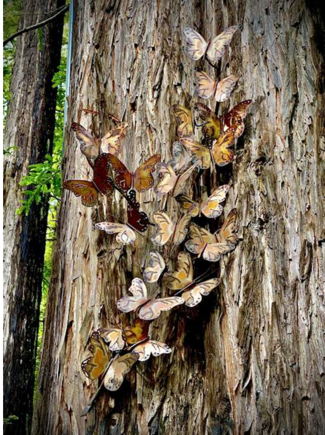
"California Kaleidoscope" by Nick Reno

More than 20 sculptures are included in the new exhibit on the grounds of Gualala Arts.