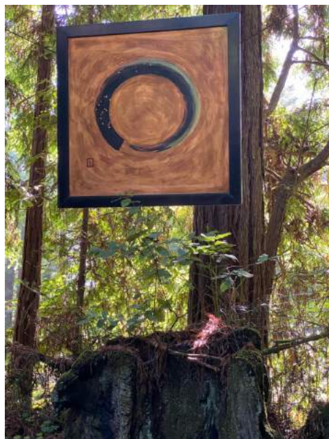
"Enzo" - featured in the Meditation Grove

This exhibit will include all new sculptures. Exhibit opens Friday, April 8.