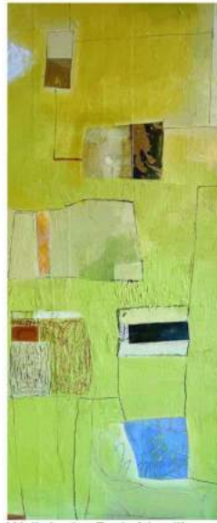
Walk in the Park (detail)