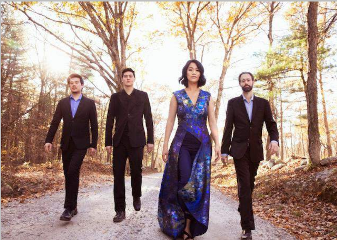
Image of The Telegraph Quartet

Great Chamber Music at Gualala Arts. The Telegraph Quartet — Sunday, March 13