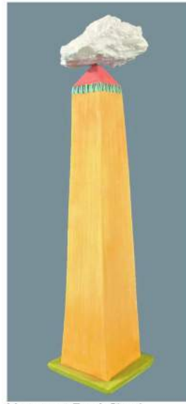
Monument For A Cloud