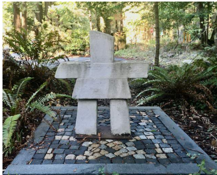
"Inuchunk" -stone landmark (Part of Current Permanent Exhibit)

"Sculpture in the Gardens" coming to Gualala Arts April 8.