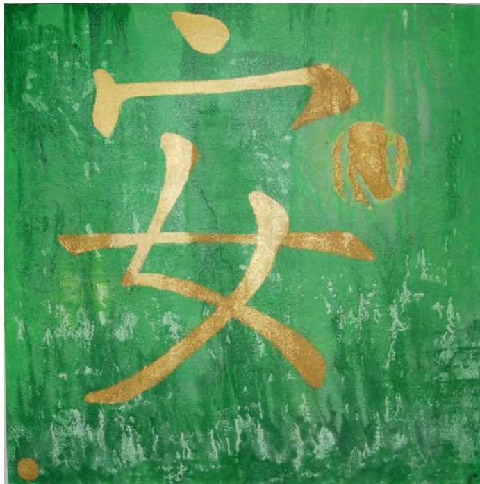
"Tranquility" - acrylic and salt on canvas by Brian Holderman.

"The Power of Hope." This is the Final Weekend for this Exhibit at Gualala Arts