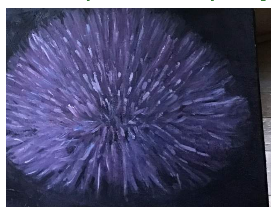
"Artichoke Flower" - by Violet Arana.