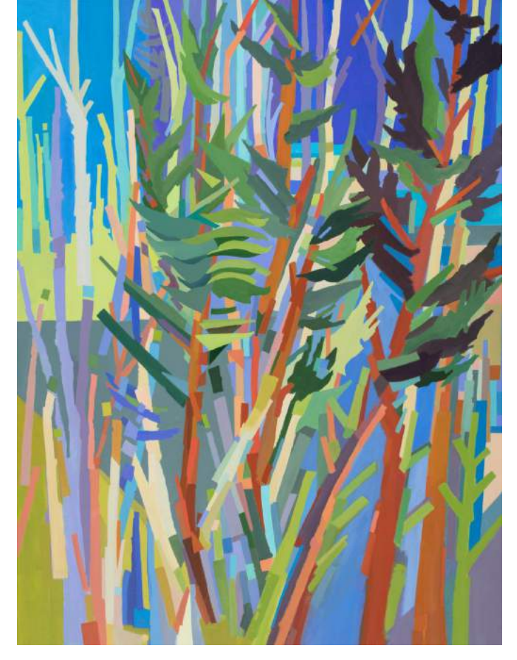
"Poplar Pine" - by Kristen Palm.

The exhibit continues at the Dolphin Gallery. Open now through March 6.