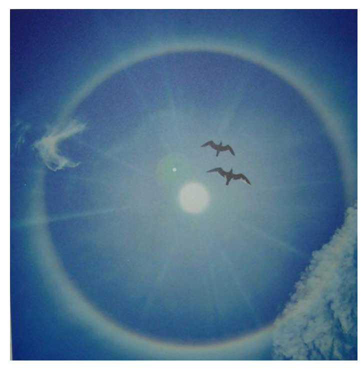
"Sun Halo: Eye Of God" - Photo on Metal by Danielle Warner.