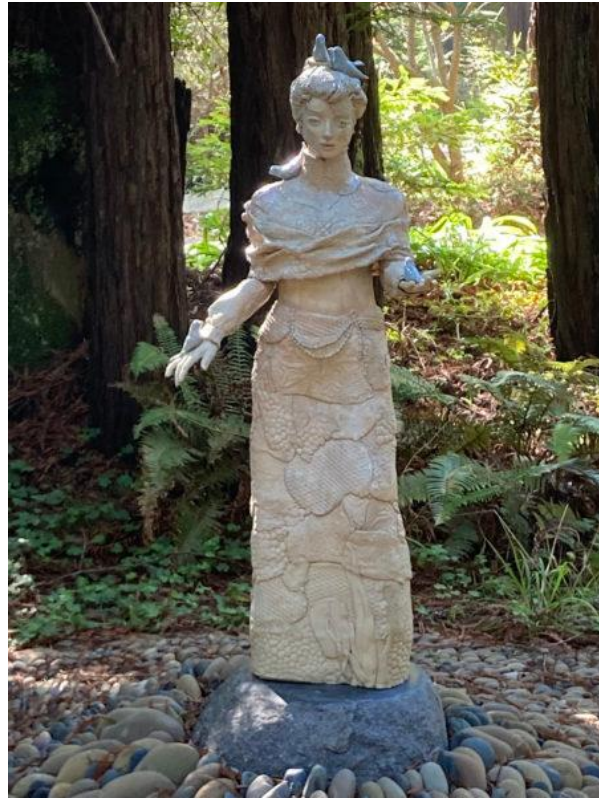
"Woman with Bluebirds" by Loraine Toth.

excellent opportunity to show your work.