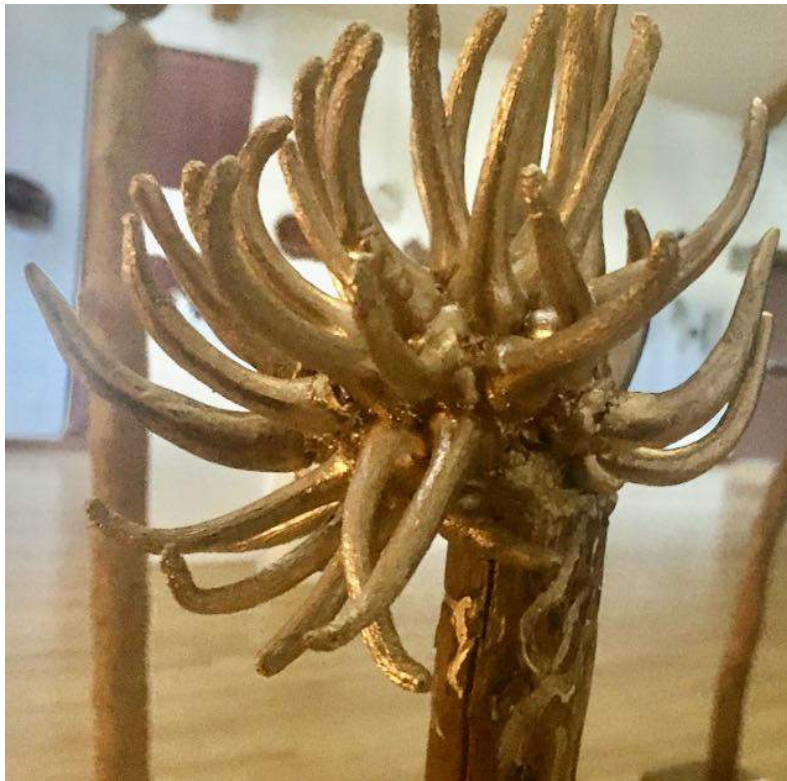
"Environmental Collaboration #1" by Ann Savageau

Fundraising Exhibit for Gualala Arts: Now 50% Off! Environmental Collaboration Poles by Ann Savageau.