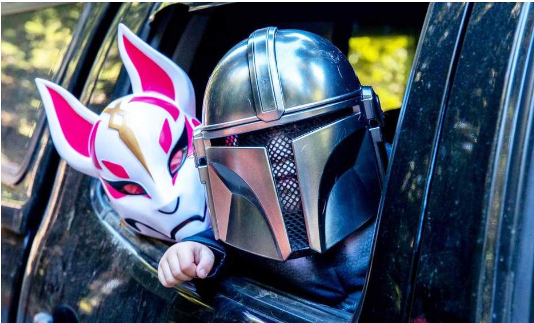
Kids in their costumes at the Trick or Treat Drive Thru

Our goal is to grow and prosper, which includes showcasing the Gualala Arts Center as the best arts destination for not only the Sonoma and Mendocino coast, but online and for the world.