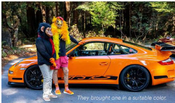
They brought one in a suitable color.