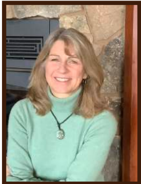
Heartbeat Dansie Little