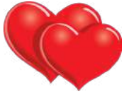
Group of the Year Gualala Arts Staff

Gualala Arts' purpose is "to promote public interest and participation in the arts." This purpose, identified so many years ago by our founders, is created and maintained by a company of dedicated volunteers. This cadre of involved and energetic individuals is the reason our doors are open 363 days per year. At the heart of Gualala Arts are the volunteers providing the foundational structures and relationships on which all of the Art Center's programs and events are built. Without such attributes being continually lived out, Gualala Arts could not function.