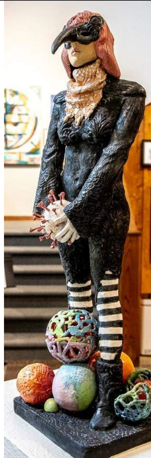
Above: COVID 2020- Where We Stand by Loraine Toth

Your continued participation is what makes Gualala Arts shine. Thank you for your continued support and sharing your artwork with us!