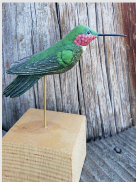
Hummingbird Carving by Chuck Petersen.