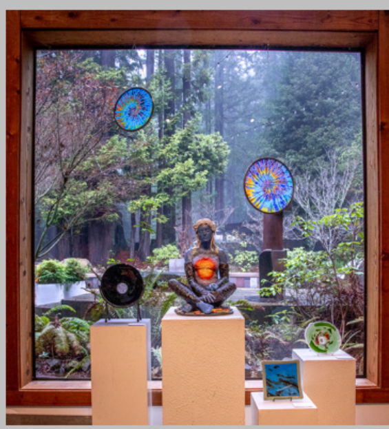
A view from the Elaine Jacob Foyer