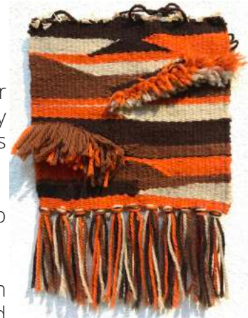
Sus, 5th Grade