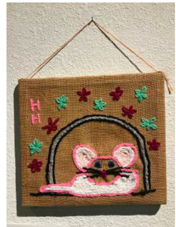
Harmony, 4th Grade