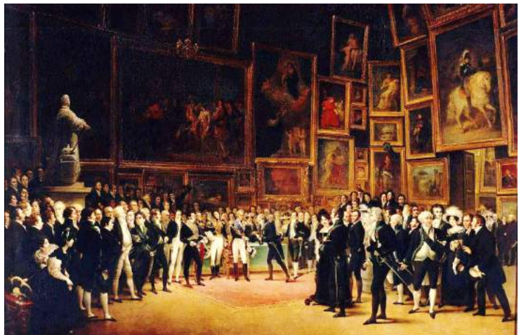
Exhibit Remains through Sunday, January 5, 2020

Opening Reception Friday, December 5 5 to 7 pm Burnett Gallery Elaine Jacob Foyer