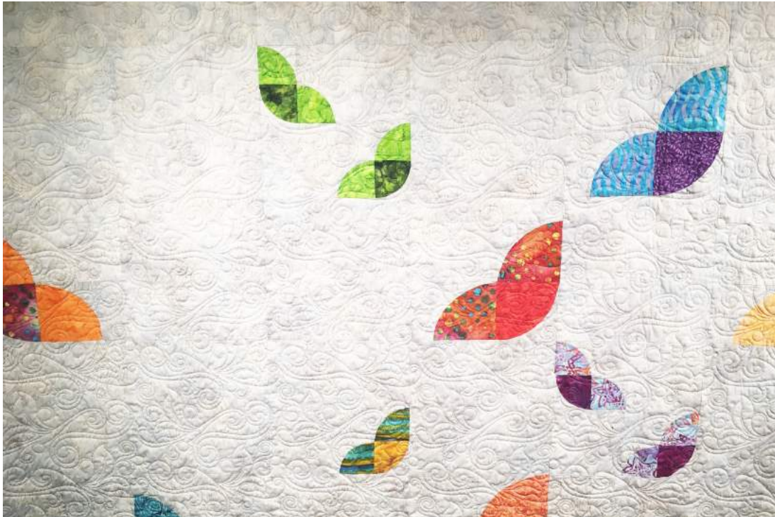
Actual Dimensions: approximately 70" x 80"

Exhibitions • Events • Workshops • Classes • And More