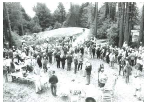
Groundbreaking April 1996

Hope to see you around this summer! I'LL BE THERE!