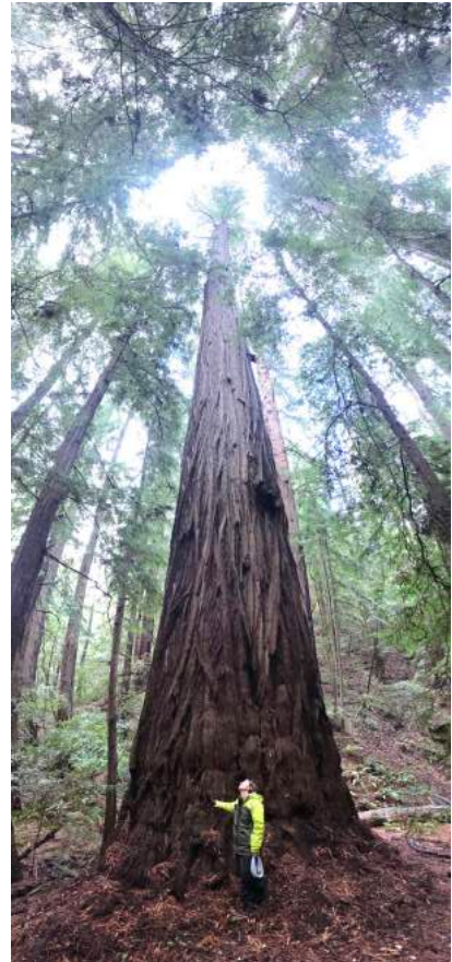
Harmony at Montgomery Woods State Natural Reserve