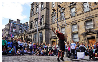
The Edinburgh Fringe Festival.

Sunday, April 29, noon to 2 pm Gualala Arts Grounds Free