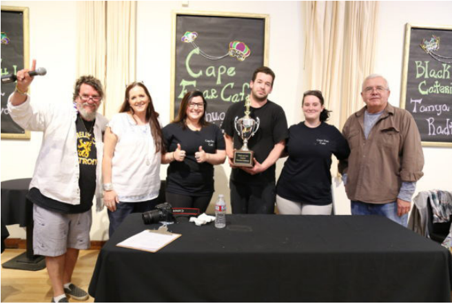
2017 Chowder Challenge winners Cape Fear Café of Duncans Mills.