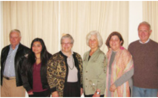
Winners of the 2017 Creative Writing Contest.