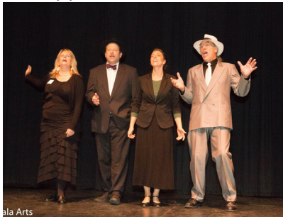
A preview of "Guys and Dolls" show!