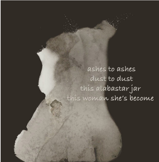
Digitally altered image by Angie Flanagan.