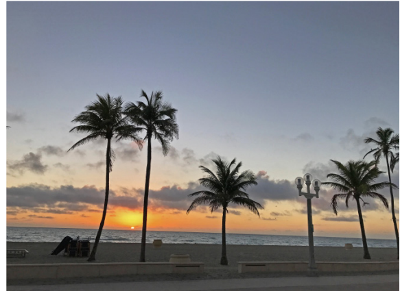
A new day in Hollywood, Florida! Sunrise 2018!