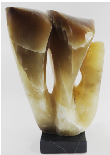
"Power or Three", Rene Dayan-Whitehead