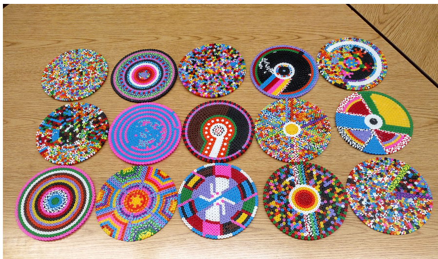
Mandalas made by Horicon 2nd and 3rd graders, led by art docents