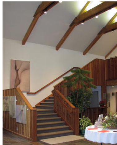
Elaine Jacob Foyer/mezzanine

You do not have to be an artist to propose an exhibit or idea and you do not necessarily have to curate the exhibit.