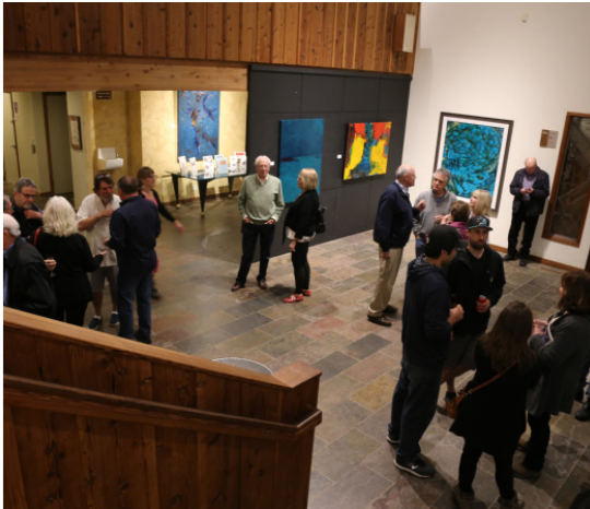
Elaine Jacob Foyer

We are looking for new and exciting ideas from existing and up-and-coming artists!