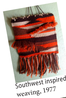
Southwest inspired weaving, 1977