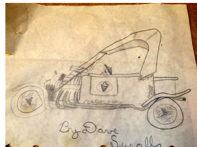
Car Sketch, 1976