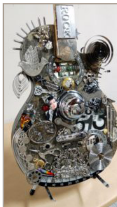
"Les is More" by Rebeca Trevino