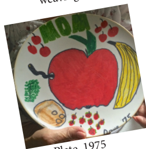
Fruit Plate, 1975