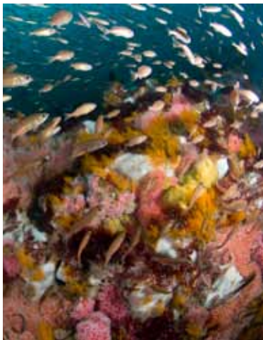
Top right: Seal's Eye View.