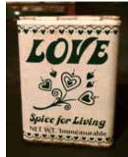
Love, the “spice” of life.