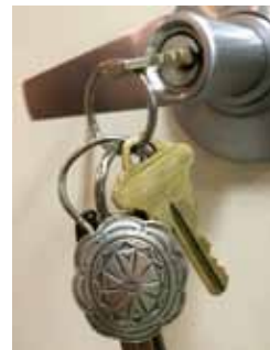
Jim's keys, a reminder that “everything is possible.”

Cover image: Hearn Gulch Sunset (detail) by Scott Chieffo.