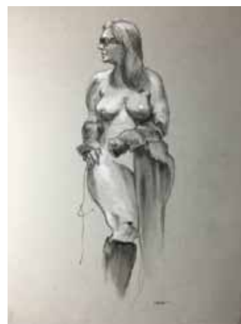
Artwork by CeCe Case