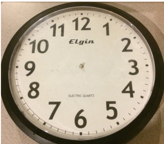
. . . there is no time like the present to give!

We are in full swing for year-end fundraising and thanks to some generous donations of all sizes, shapes and kinds we are making a strong finish to a very interesting year. There is still time before the end of the year for you to help us meet our budget by way of your gifts! We have had several appreciated securities donated by people wanting to avoid capital gains taxes while taking advantage of the heightened market -- they will get a nice donation letter instead of a tax bill!