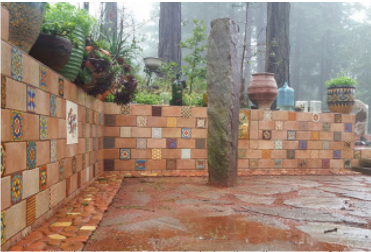
Peter Mullins' landscaped property includes tile walls, mosaics, follies, extensive xeriscaping, and stone obelisks.