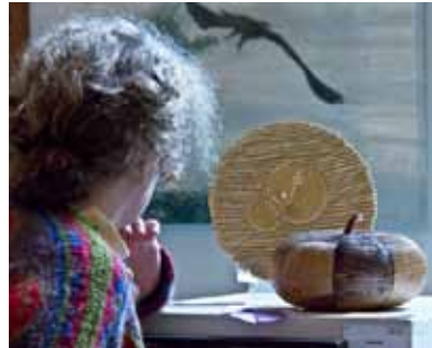
Artwork and celebrants from previous years at Art in the Redwoods Festival.