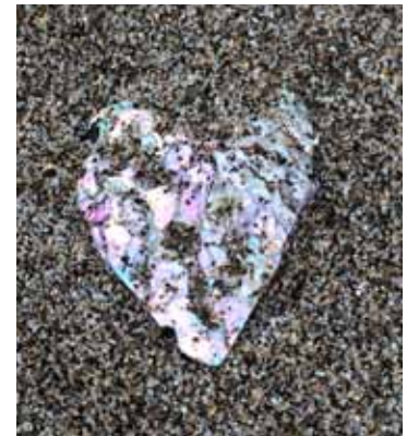
Symbols of gratitude ...

Cover art: La Cage aux Folles image by Eric Wilder.