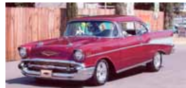
Cars entered in 2016 Gualala Arts 8th Annual Auto Show.