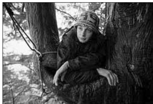
Julia “Butterfly” Hill