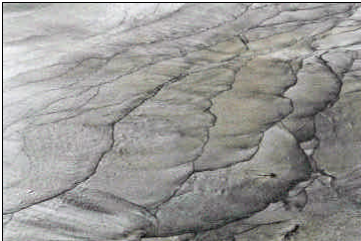
"Intertidal Abstract" by Scott Chieffo

June, the month of the summer solstice, is a fitting time to display the work of these artists whose works celebrate the power of light to delight and to reveal a unique vision of nature. Inspiration from local settings makes their work even more meaningful for North Coast residents.