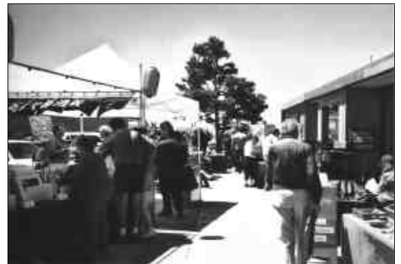
Summer Saturday Art Fest

July 9 & 10: Summer Chamber Music Weekend at Gualala Arts Center.