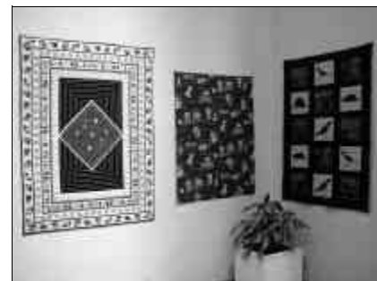
Last year's Challenge Quilt exhibit

The show will hang at Gualala Arts from June 11 through July 4.