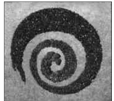
Artwork by Brigitte Micmacker

For a prospectus please go to: http://gualalaarts.org/Exhibits/GAC.asp .