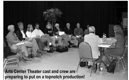
Arts Center Theater cast and crew are preparing to put on a topnotch production!

London Suite also runs Saturday and Sunday, July 17 and 18, and then continues Friday through Sunday, July 23–25. Friday and Saturday shows are at 7:30 p.m. Sunday matinees are at 2 p.m. Tickets for all performances other than the opening are $12. Arts Center Theater's last three shows have been sell-outs, so get your tickets early. You wouldn't want to be the only one on your street to miss all the fun!