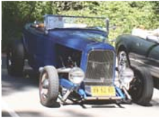
Hot Rod through 1942

C'mon, you all know what a Hot Rod is. It can be any period correct body style (roadster, coupe, sedan, pickup, panel truck, cabriolet, etc.).