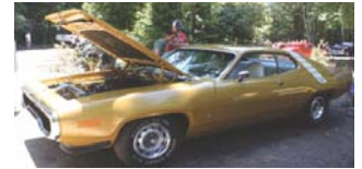
Stock 1970 through 1999

If your car looks like it came from the factory from 10 feet away and when you open the hood and doors it looks that way as well, these are the classes for you: