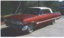
Stock to 1969