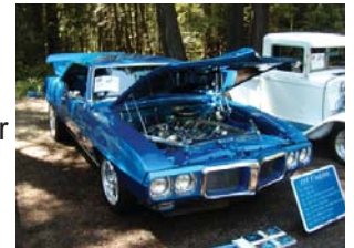
Custom/Modified 1960 - 1999

Customs typically have been chopped, channeled, flared, frenched and/or had other body modifications made and always have a custom paint job.