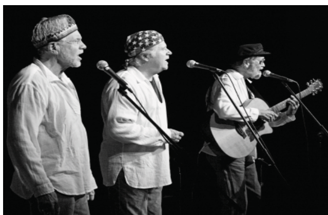
THE CROCKETT BROTHERS