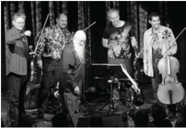
TERRY RILEY W/ KRONOS IN 2009