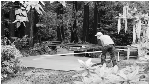
CONSTRUCTION HAS BEGUN ON THE BREAD OVEN

We will honor our major financial donors and inaugurate a newly created Donor's Grove.