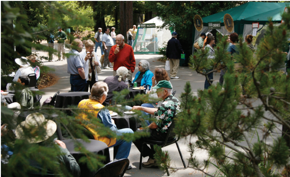
A variety of food, beverages, snacks and treats may be enjoyed on the grounds of the Gualala Arts Center during the two-day event.