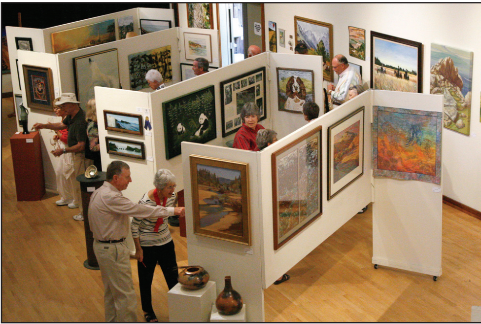
Each August, the Gualala Arts Center is filled with nearly 400 entries in the Art in the Redwoods show, ranging from paintings and graphics to sculpture, photography and digital art.